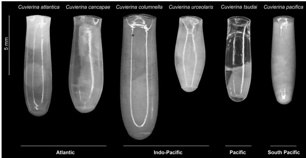
Figure 3. Typical specimens of six Cuvierina species.