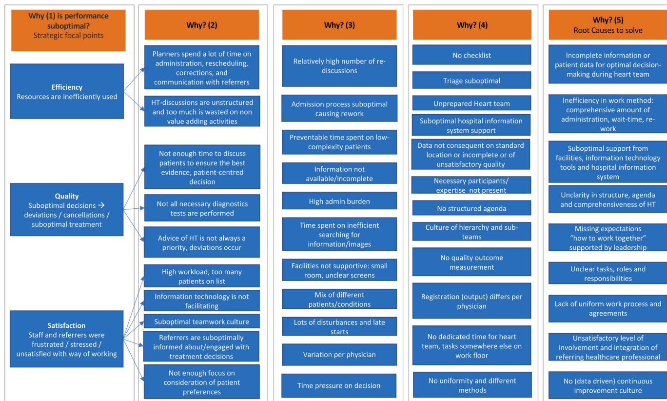
Figure 2 Five Whys Root Cause Analysis. HT, Heart Team.