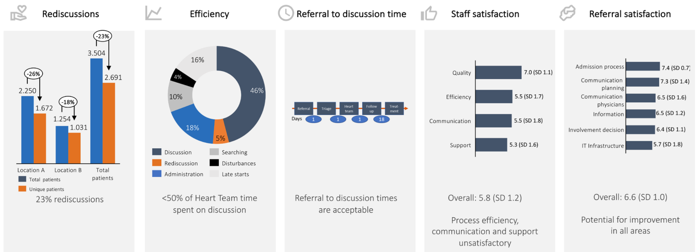
Figure 3 Results of baseline measurement. IT, information technology.