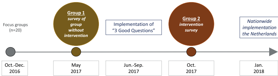
Figure 1. Flow diagram of the study