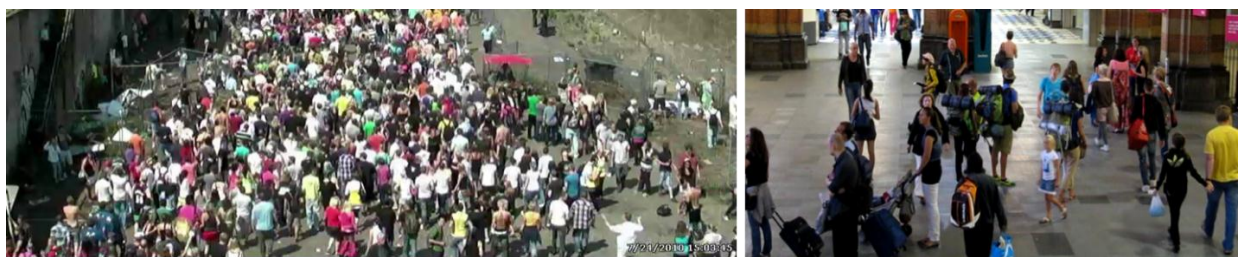
Figure 1. Two frames from the sequences with the music festival and the train station.

In the following, we first introduce the evaluation criteria used in the paper. Then we discuss the implementation of the different tracking approaches separately. Finally, we evaluate the tracking algorithms and compare the tracking results in both scenes.