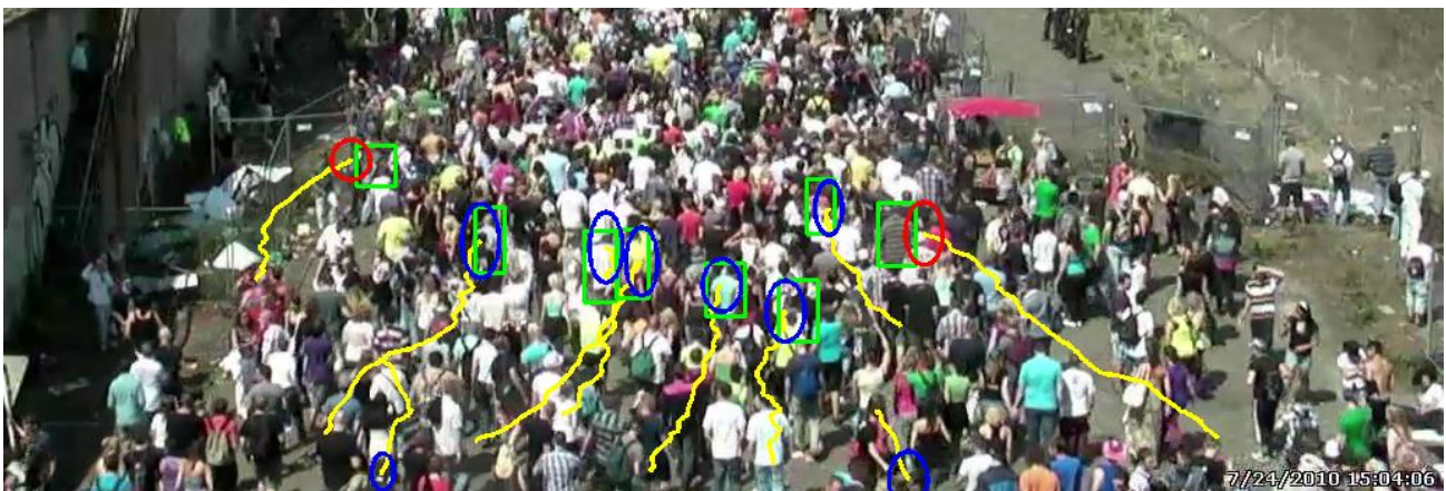
Figure 2. By exploiting the previous observation in the local area, most of the pedestrians are tracked as they moved through a high density crowd.

To compare the baseline particle filter (PF), state-of-the-art motion patterns (PF+MP+HMM) and the novel previous-observation (PF+PO), we applied each approach to the two scenes. To reduce the randomness, each pedestrian is tracked for 10 iterations. A few examples are shown in Figure 2.