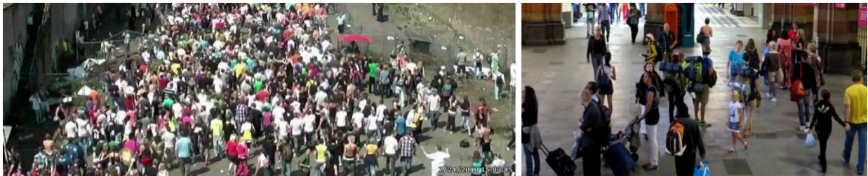
Figure 1. Two frames from the sequences with the music festival and the train station.

In the following, we first introduce the evaluation criteria used in the paper. Then we discuss the implementation of the different tracking approaches separately. Finally, we evaluate the tracking algorithms and compare the tracking results in both scenes.