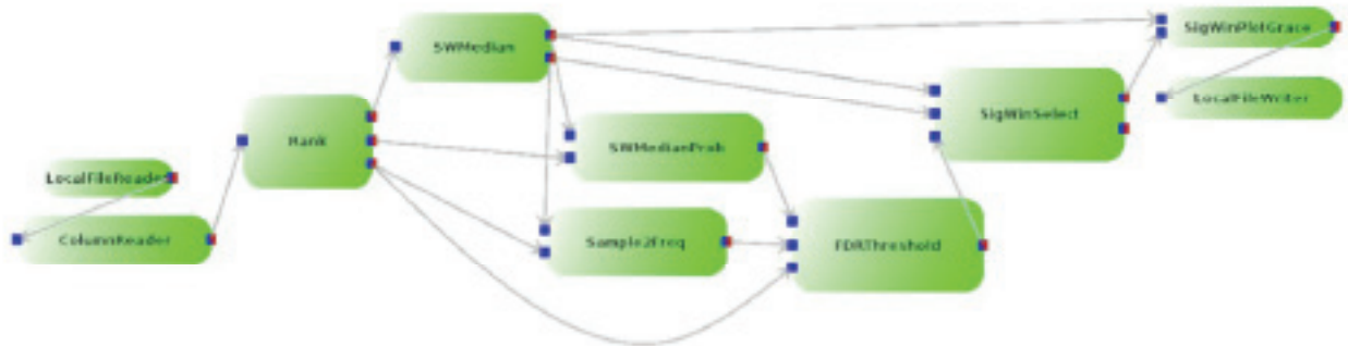
Figure 1: Example of a scientific experiment modeled as a workflow. This workflow is used to detect ridges in sequences of data sets such as Gene Expression sequence or Human transcriptome map.

while edges describe some dependency such as data or control. The popularity of MyExperiment [17] and scientific workflow management systems such as Kepler [3], Taverna [19], and Triana [27] are proof that workflow systems have become a commodity within the e-Science community. Workflow management systems help researchers to organize the interdependencies of processes/operations, and their dependencies, of which an experiment is composed into a well-formed description. The resulting workflow can be stored, shared, and executed by other researchers. Demonstrated by many real examples, workflows are suitable to describe a wide range of scientific experiments [11]. Therefore, in the EP model, to accurately and unambiguously describe a reproducible and executable experiment will be best implemented by workflows, which has three additional advantages: state-of-the-art in workflow management systems provide (1) execution environments supporting computational and data intensive experiments, (2) traceability of experiments, and (3) technology to implement short and long term compatibility.