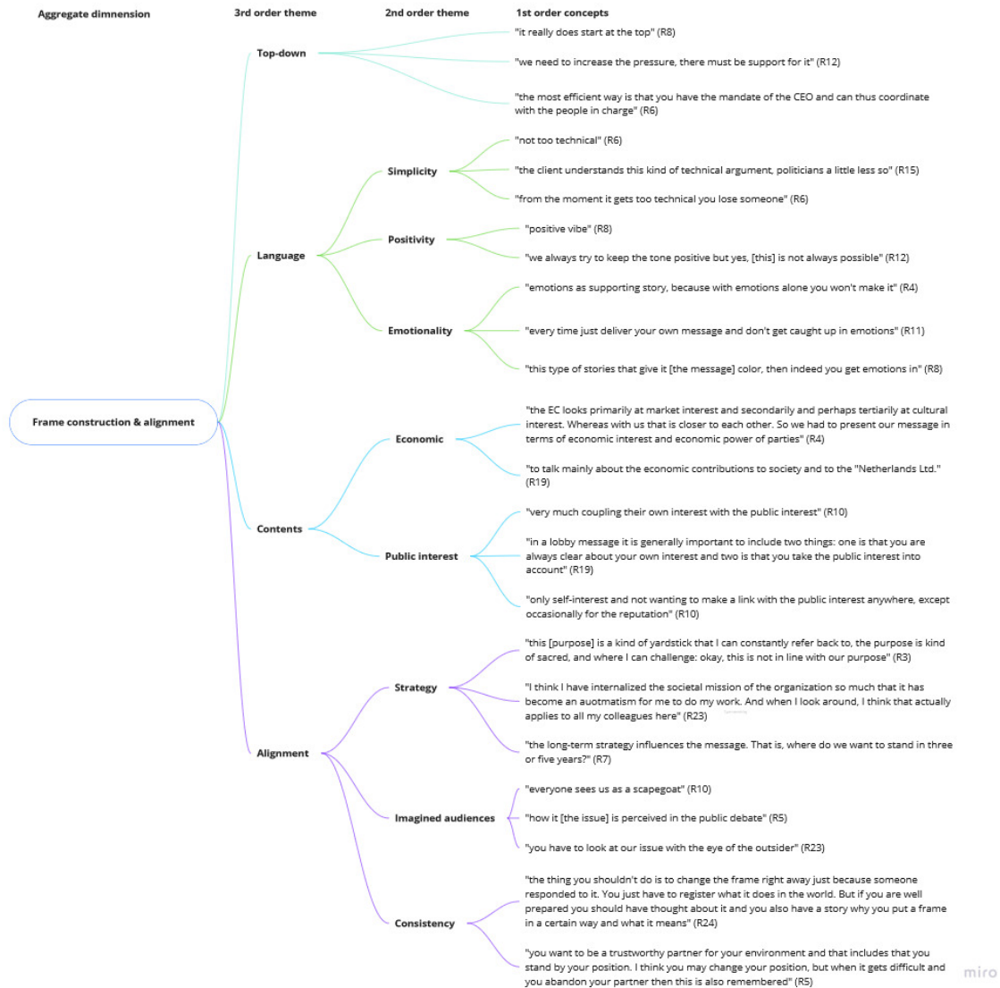
Figure 1. Example of the relations between lower-order concepts and an aggregate dimension.