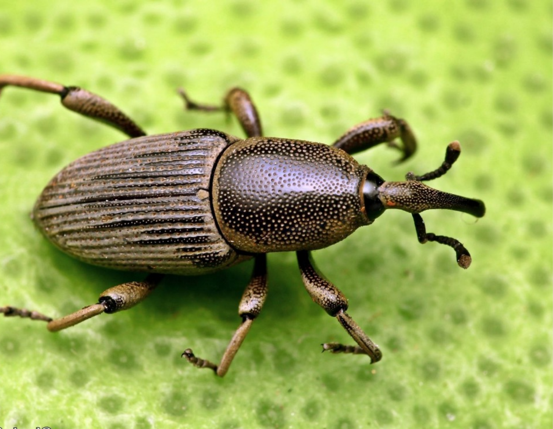
Cosmopolites sordidus (E.F. Germar, 1823) or, banana weevil