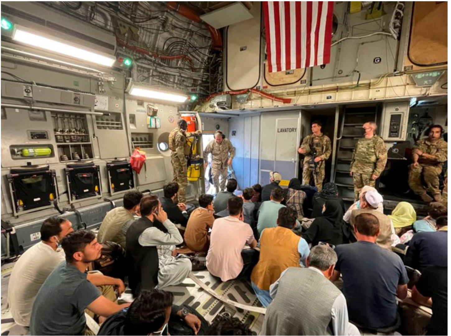
Evacuating Afghan civilians at Kabul airport, following the Taliban takeover of Afghanistan, 17 August

R eactions across European states to the takeover of power by the Taliban in Afghanistan are markedly ambivalent. Politicians admit failing to speedily process admission for those Afghan employees who worked directly for European governments, while warning against irregular migration flows from Afghanistan and a repeat of the so-called 'open-door' policies seen in 2015.