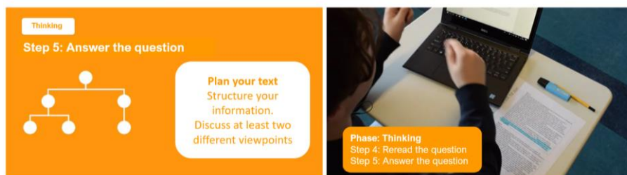
Figure 1. Video fragments: an instructional slide (on the left) and a still from the modelling peer illustrating the process (on the right). The original video was in Dutch.

In the subsequent phase of the study, we implemented the design-as-constructed into practice, which is described in the next sections.