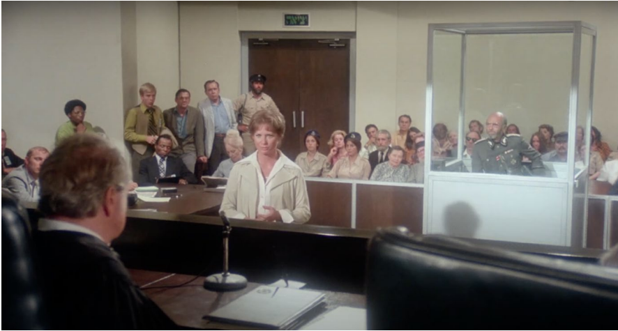
Fig. 2 The cabin in a still from The Man in the Glass Booth

your testimony or response become irrelevant'. This dialogue is particularly interesting as it indicates two values afforded to the object: as well as the material quality mentioned above—bulletproof protection for the man inside—it also represents a means for the trial to control his testimony, his speech, 'should it become irrelevant'. Hence the film provides an extra layer of meaning to the cabin-symbol, indicating the need to limit the vital space of the perpetrator.