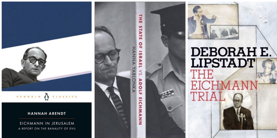
Fig. 5 Paratext-covers of books about the 1961 Eichmann trial

committed by Eichmann and the Nazis in general and the memorial warning to not repeat those crimes, filtered through the force of justice.