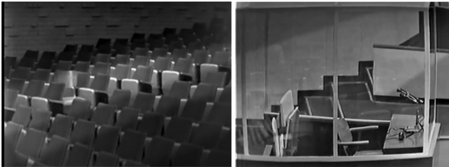
Fig. 3 Two stills from the opening sequence in The Specialist

The second example, The Specialist , further stratifies the role that courtroom furniture plays in the construction of the imaginary of this trial. In this case, as mentioned, the film is a documentary and therefore shows the actual scenes at Beit Ha'am. Following the opening credits, the film uses a series of establishing shots to set out the spaces of the theatre. It lingers on the glass cabin. This is depicted over a very specific musical soundtrack that uses a combination of shrill and deep, loud sounds and an irregular rhythm to create a tense, creepy sensation—evidently echoing the soundtrack of a horror film. This is further emphasised through the montage, which sometimes matches the rhythm of these sounds. At one point a particularly loud, high-pitched note of a string instrument plays as the camera cuts from the empty seats of the auditorium to a close-up of the empty cabin (Fig. 3).