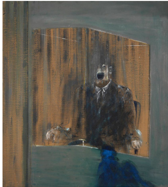
Fig. 1 Study for a Portrait by Francis Bacon © The Estate of Francis Bacon. All rights reserved. DACS 2018