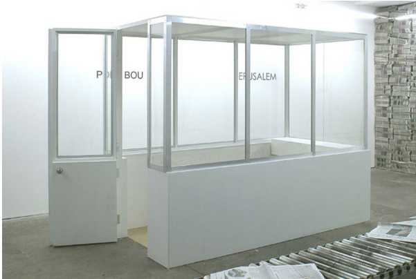
Fig. 6 Eichmann and the Angel installation by Gustav Metzger [37] © Gustav Metzger

to imprint itself in the popular imagination, becoming an effective narrative trope that represents a wickedness that does not repent for its crimes.