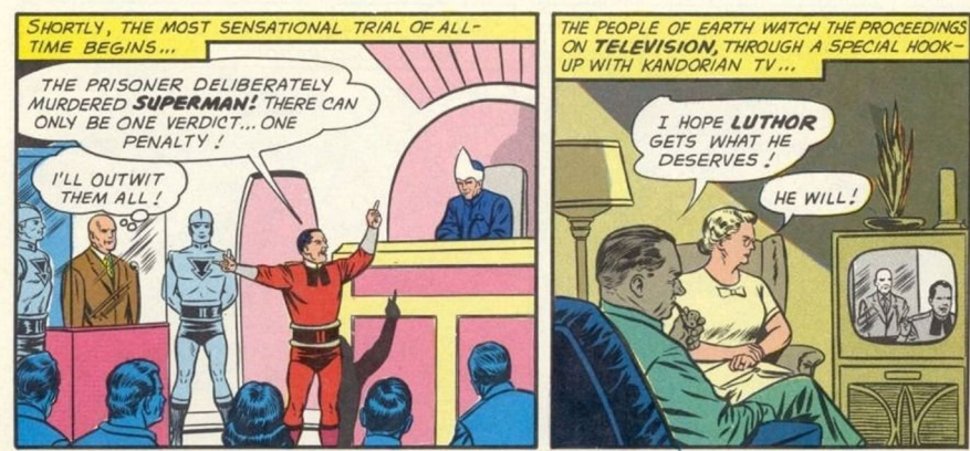
Fig. 4 A comic strip featuring Lex Luthor on trial in a glass booth, recalling Adolf Eichmann, and people watching it at home ('The Death of Superman', November 1961)

reflections linked to more general forms of judgement, responsibility or non-admission of guilt. In what remains of this section, I will briefly introduce instances of the first three of these types, before a more detailed analysis of the fourth one in the final section of the essay.