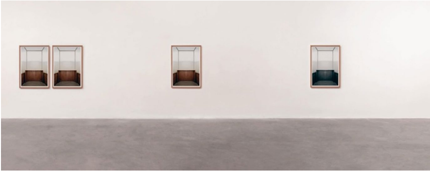
Fig. 7 Glass by Moshe Ninio ([40]) © Moshe Ninio

of events, he sees one single catastrophe which keeps piling wreckage upon wreckage and hurls it in front of his feet ([12]: 257).