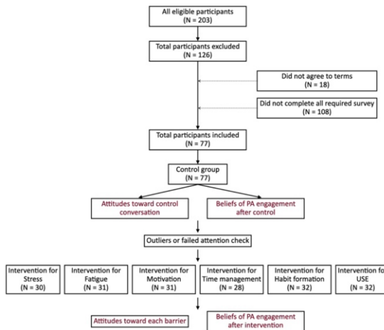
Figure 1. Flow of the study procedure and the recruitment process.

This present study was designed to evaluate interventions to overcome different perceived barriers to PA. We employed a within-subjects design where all participants were presented with three random chatbot interventions and a control condition. Each intervention conversation addressed a specific barrier to PA, while the control conversation did not address any barriers. Three dependent variables were investigated in the study: beliefs in PA engagement, attitudes toward the effectiveness of the interventions in resolving their respective barriers to PA, and the overall chatbot experience. The study was approved by the Ethics Committee of Social and Behavioral science faculty in the University of Amsterdam. (ERB number: 2022-COP-15774)