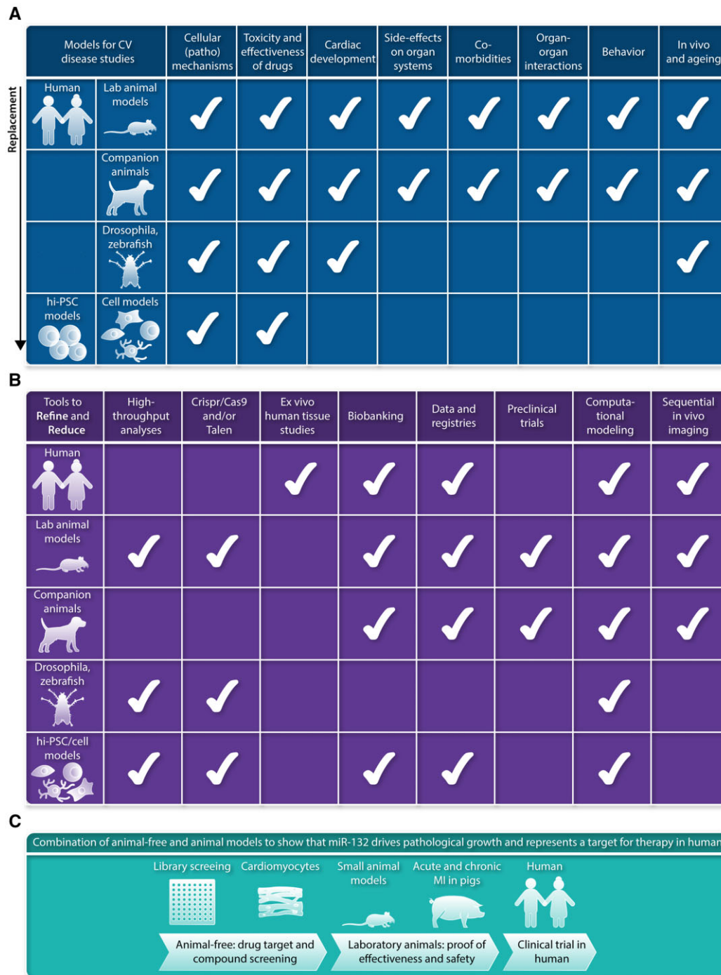
Figure 1 (A) Models that are available for studies on cardiovascular disease, ranging from human and laboratory animals to stem cell-derived models. Aspects that can be measured currently in the different models are indicated with the white check mark. This overview shows that several models allow to reduce the number of studies in laboratory animals, as many initial steps in identification of pathomechanisms, testing drug toxicity and drug effectiveness can be studied in cell-based models. Clearly, studies in human itself offers multiple opportunities to reduce the work in laboratory animals. (B) Multiple tools have been developed in past years to refine and replace studies in the models used for cardiovascular research, and range from tools and expertise to characterize human tissue samples obtained during surgery to models derived from hiPSCs (human induced pluripotent stem cells). (C) Example of an experimental design making use of available complementary research models based on the 3R principles. 2

pathways triggered by the initial cardiac injury. This includes CM remodelling and alteration of metabolism, followed by progressive LV dilatation (eccentric remodelling), associated with extensive remodelling of the