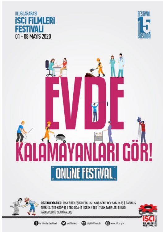
Fig. 1: The festival poster depicted the vital professions.

making it accessible to low income earners and precarious groups. Screenings provide ample space for discussion, attracting a combination of workers, activists, filmmakers, students, and cinephiles. Going against the competition-driven disposition of major film festivals, the Labour Film Festival has no marketplace, no industry events, and no competition. Screenings and panels are held at multiple locations ranging from arthouse theatres to factories and community centres in a number of cities. Instead of honouring a single festival venue, it spreads across the country with the intention of creating room for social gathering, safe space for discussion about the predicament of working-class struggles, and political organisation, in Diyarbakir, Eskisehir, Adana, and Northern Cyprus, alongside Istanbul, Izmir, and Ankara. The festival opens every year on the 1st of May – International Workers' Day. The opening ceremony takes place the following day and gives the stage to workers to address the theme of that year.