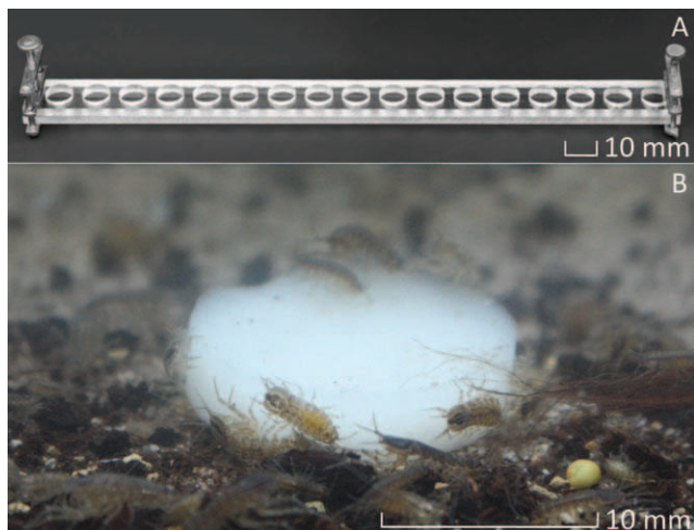
FIG. 1. Polycarbonate mold used to prepare DECOTABs (A), and isopods ( Asellus aquaticus ) rallying around and feeding on a basic cellulose DECOTAB (B).

for up to 3 wk in the refrigerator without noticeable decay or dehydration. We measured the dry mass of freshly prepared tablets (mean \pm 1 SD = 81.3 \pm 3.1 mg, n = 25 ) by drying them for 3 d at 70^\circ\text{C} and then weighing them with an analytical balance (precision = 0.1 mg; Mettler AT261, Mettler-Toledo, Tiel, The Netherlands).