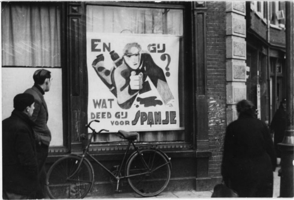
Figure 3. 'And you? What did you do for Spain?', enquires a poster depicting a dying Republican soldier of Amsterdam passers-by. The poster was published by the Dutch Aid Spain Committee ('Hulp aan Spanje'), ostensibly an unaligned pro-Republican organisation but one whose board was composed solely of 'crypto-Communists', who kept their membership of or affiliation with the Communist Party a secret.