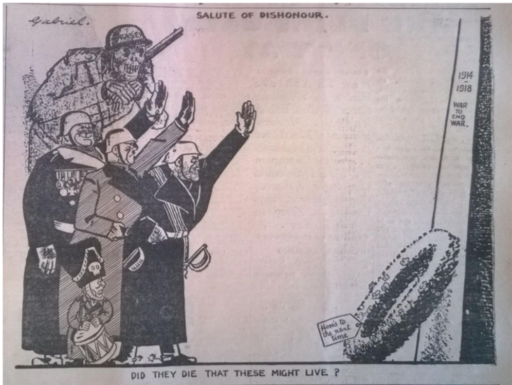
Figure 2. Daily Worker , 11 November 1936, 5. 'Did they die that these might live?' Nazis, fascists, Franco-ist rebels and 'death' ironically salute a monument to the Great War dead.