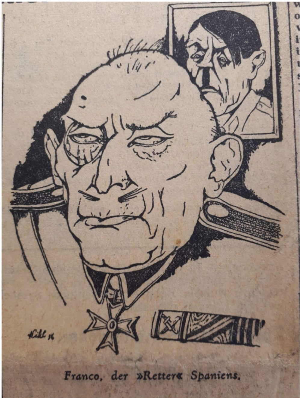
Figure 1. Deutsche Volkszeitung , 16 August 1936, 1. IISG, DVZ: Deutsche Volkszeitung (ZF 1086). 'Franco, the Saviour of Spain', wearing a German uniform, is watched carefully by a picture of Adolph Hitler.

European or even a global fight against fascism permeates nearly every article, brochure and image put out by pro-Republican outlets, parties and newspapers. That the war was taking place in Spain itself was therefore more or less accidental. What was important was the assertion that General Franco and his fascist allies abroad would not win. Moreover, further underscoring national and gender stereotypes was the frequent portrayal of Franco and the entirety of the 'Nationalist' faction as mere