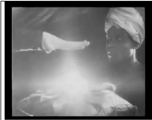
Figure 11. Mephisto reveals the wedding present, carried by a black servant and bathing in light, to the Duchess of Parma.

firmly established earlier in the film, triggering further interpretations commensurate with it, even when the cues are more subtle. But in this scene a straightforward, non-metaphorical reading is possible as well: Mephisto simply does the servant's job of making light before the master arrives; and the swinging of the lamp can be understood as showing Mephisto' quirkiness.