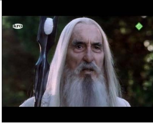
Figure 1. Saruman appears in light, and in immaculate white clothes, and thus seems to be completely good ...

respectively, and reinforced by lighter versus darker colours in the mise-en-scène . Indeed, the manner in which the LIGHT/DARK symbolism is deployed in the Lord of the Rings trilogy is a veritable catalogue of the GOOD IS LIGHT and BAD IS DARK conceptual metaphor.