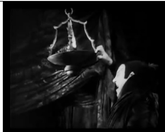
Figure 12. Having lit the lamp in front of Faust's bridal bed, Mephisto swings it to and fro (stills from Faust ).