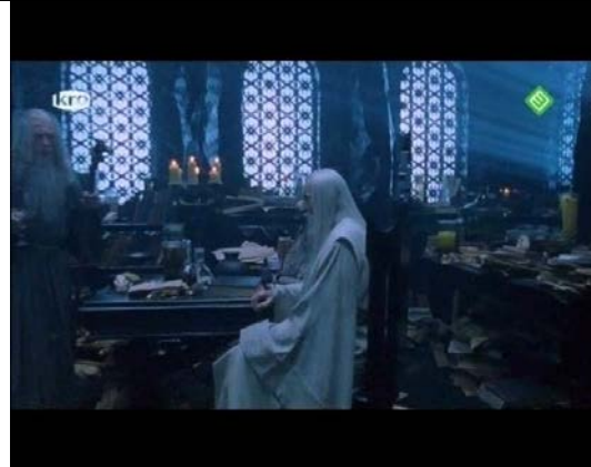
Figure 2. ... but as soon as Gandalf and Saruman are inside the latter's tower, the light suddenly darkens, anticipating Saruman being exposed as bad (stills from The Fellowship of the Ring , originals in colour).

But even here there are scenes in which this cliché is put to a use that arguably reveals some creative play. One is the portrayal of Saruman, the much respected former teacher of Gandalf. When Gandalf first meets Saruman to seek his advice, the latter is depicted in goodness-connoting bright light, further reinforced by his white cloak and beard (figure 1). It is to be noted that Gandalf is dressed in grey – which reflects the awareness that he is not 100% good; indeed Gandalf realizes that he cannot fully trust himself to destroy the ring, and that this task must be left to Frodo (I owe this observation to David Ritchie). When Saruman and Gandalf have reached Saruman's tower, the light suddenly darkens (figure 2). Very soon afterwards it transpires that Saruman is actually a servant of the Über -villain Sauron, and after winning a fight with Gandalf Saruman locks him up. The point here is that the suddenly dimmed light in Saruman's tower warns the attentive film