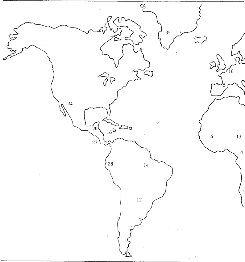
Map. Approximate location of the languages in the sample