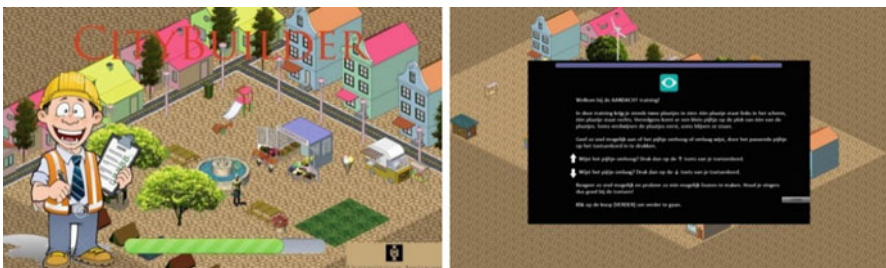
Fig. 14.2 Shell game “CityBuilder.” Game screen on the left, embedded training task overlaying the game screen on the right (Adapted from Boendermaker et al. 2013. Copyright 2016 by the authors. Reprinted with permission)

By performing well on the training (i.e., based on speed and accuracy), they receive points that can be spent buying a variety of objects to build a custom city, after the training block is over. Going one step further, combining these two