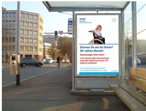
Figure A1. Stimuli example of negative campaign poster in an urban setting.