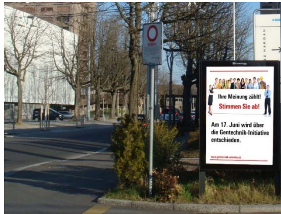
Figure A3. Stimuli example of filler campaign poster in an urban setting.