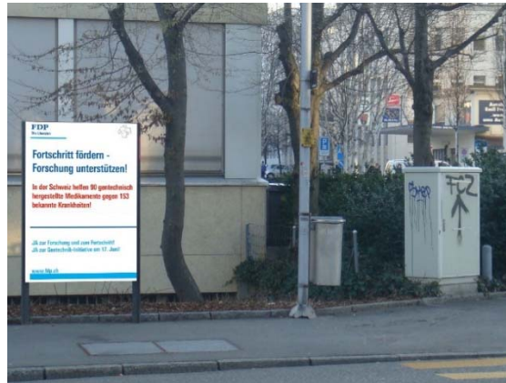
Figure A2. Stimuli example of neutral campaign poster in an urban setting.