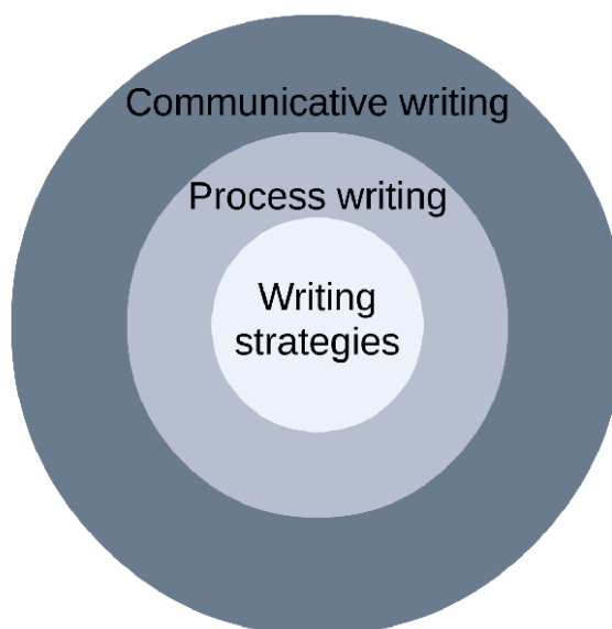
Figure 1. Three embedded approaches to the teaching of writing in the comprehensive writing program.

In the comprehensive writing program we focused on communicative aspects of writing, on writing as a process, and on the teaching of genre-specific writing strategies for five functions or genres; description, instruction, explanation, argumentation, and narration. Figure 1 visualizes how the three approaches were linked in the comprehensive writing program.