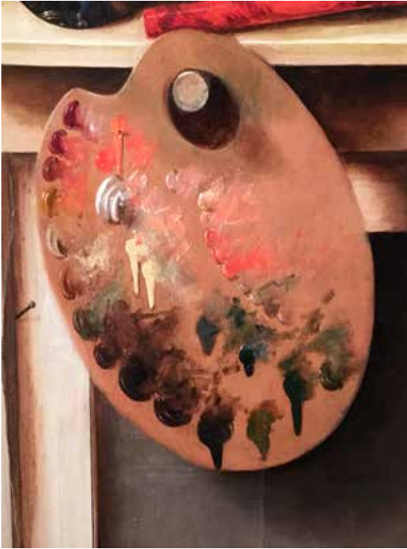
Figure 8.4 Cornelis Norbertus Gijsbrechts, Cut-Out Trompe-l'Oeil Easel with a Painter's Palette and a Fruit Piece , 1670–1672, oil paint on wood, 226x123 cm (h x w), Statens Museum for Kunst Copenhagen, inv. no. KMS5.

The anonymous author devoted much attention to smalt grinding, offering several options for the best binder; this writer discussed washing – or not washing – the pigment, and the level to which it needed to be ground (see table 8.3). 42 Some paints were quite liquid, and painters would run the risk of drips if they applied such paint in thick layers or without a binder that contained a drier – a reality Cornelis Gijsbrechts playfully included in the palettes he depicted in his trompe l'oeil paintings (fig. 8.4). The different properties of the paints on Gijsbrechts' palette are evident: some stand stiff while others have less bulk, some pigments are even running off the palette. Paints in the third row on the palette do not present the problem of running off the palette. This is explained by the fact that this row contains the pure colour in mixture with lead white, the white pigment lending its stiffness to the toned mixture. Painters needed to negotiate pigment properties,