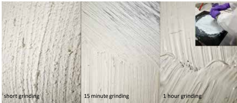
Figure 8.5 Three paints consisting of lead white ground in linseed oil, observed with a microscope at ten times magnification. The paints have been ground for increasing lengths of time and have been applied with a brush to a plastic sheet (Melinex).

Figure 8.5 provides images of the three paint variations described above, as they appear when viewed through a microscope at 10 times magnification. The proportions of lead white and oil are the same in all images. The only difference is the amount of grinding time.