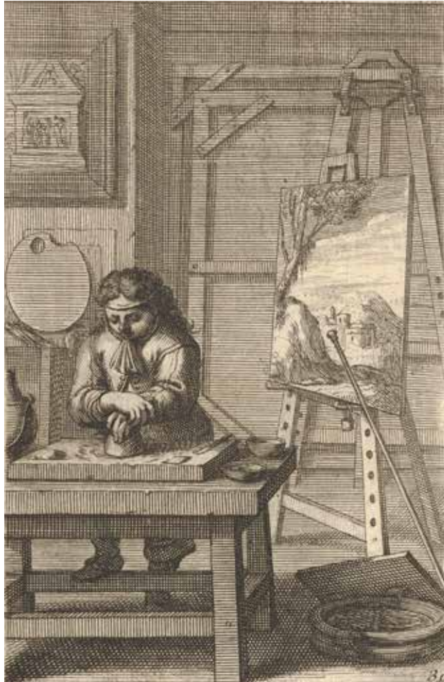
Figure 8.1 Abraham Bosse, A Painter in His Studio , c. 1667, etching, 263x186 mm, New York, Metropolitan Museum of Art, inv. no. 2012.136.173.