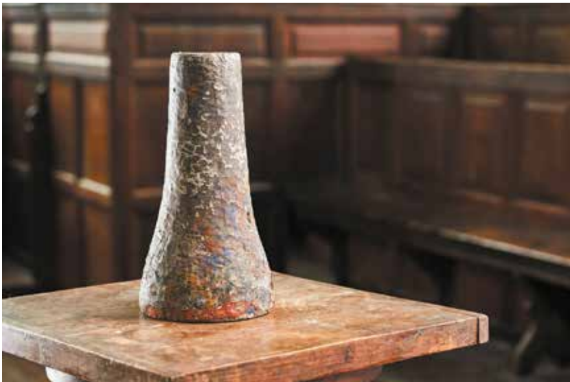
Figure 8.3 A stone muller that is still covered with a crust of old paint, dated to the eighteenth century by its owner: The Table Gallery. Dimensions: 13,5x27,5 cm (diameter x height).

instructions to purchase only unpolished or 'ground' glass mullers, and by instructions for the dressing of the muller's grinding face – it is to be smoothed and flattened on a flat surface using mild abrasives. 30