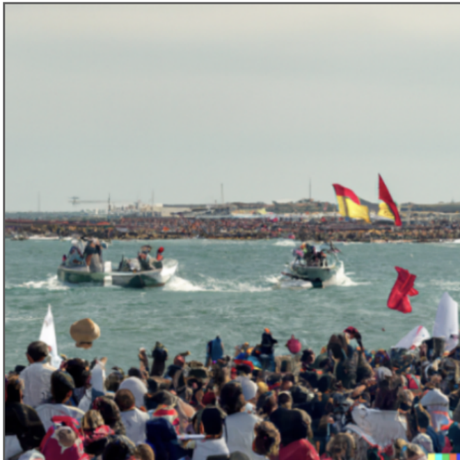
Figure 2. Example of a fake image.

Thousands of Italians gather to the shore to welcome refugee boats as a demonstration against government's tighter anti-immigration policies