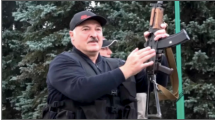
Figure 1. Example of a real image.

Belarus' leader helicopters over Minsk with a rifle as protesters below demand his resignation