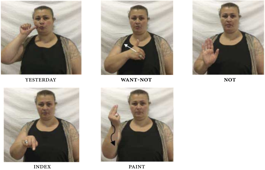
Figure 5. The verb WANT-NOT used in a past tense context: ‘Yesterday I did not want to paint it’; note the combination of the irregular negative form WANT-NOT with the negator NOT