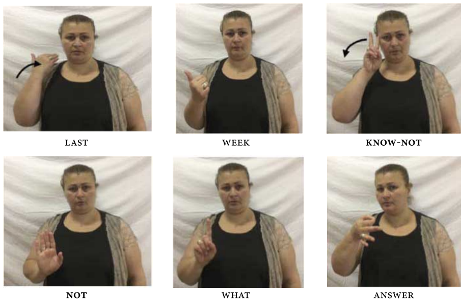
Figure 4. The verb KNOW-NOT used in a past tense context: ‘Last week, I did not know what to answer’; note the combination of the irregular negative form KNOW-NOT with the negator NOT

mar framework assume that tense is present in the phrase structure (in the form of a tense or inflectional phrase, TnsP/IP ; cf. Pollock 1989) despite the absence of tense inflection. These studies usually assume that modal verbs are hosted by TnsP/IP (Neidle et al. 2000; Pfau & Quer 2007; Cecchetto et al. 2009; Gökgöz 2011). Still, these studies do not demonstrate that tense is a grammatically relevant feature that would, for instance, trigger verb movement or some other grammatical operation. 5 In principle, modals might as well be hosted by dedicated modal projections (Cinque 1999). In contrast, the patterns we report clearly show that tense has a grammatical impact in GESL in that it determines the choice of negation strategy – albeit for a small group of verbs.