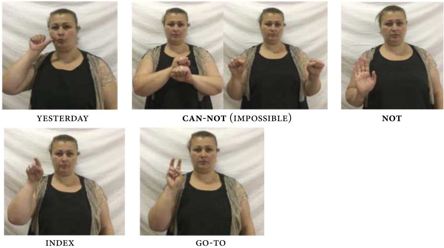
Figure 6. The verb CAN-NOT used in a past tense context: ‘Yesterday it was impossible to go there / one could not go there’; note the combination of the irregular negative form CAN-NOT with the negator NOT