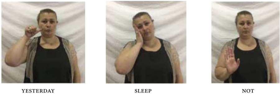
Figure 1. Negated intransitive clause ‘Yesterday I did not sleep’

The figures below illustrate the pattern of basic clausal negation that we have identified, a negated intransitive clause involving the predicate SLEEP in Figure 1, a negated transitive clause with the predicate WRITE in Figure 2. In both cases, the manual negative sign NOT , which involves a sideward movement of the hand, occupies the clause-final position. 2