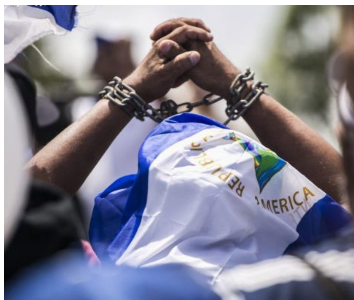
Photo by Jorge Mejía peralta. We Are the Voice march, September 23, 2018. CC BY 2.0.

With the mediated cauterization, execution, judicialization, and large-scale confinement of protesters, the government deployed every element of the Sistema. Previously, the Sandinista state’s politics of cauterization was directed at communitarian others: first and foremost those deemed “delinquent youth” (that is, mainly young boys and men from marginalized neighborhoods, held to be “destroying communities” by selling and using drugs).