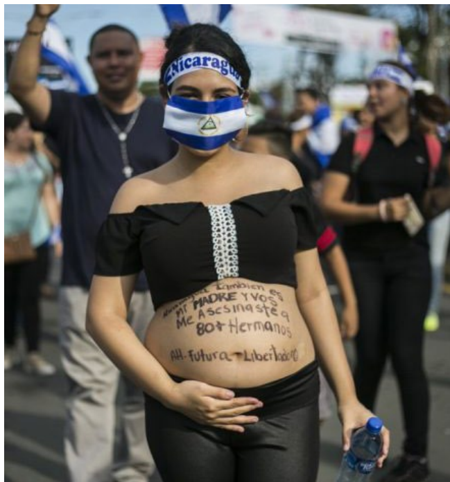
Photo by Jorge Mejía peralta. Massive peaceful demonstration in solidarity with the mothers of the murdered, disappeared, and detained by the Ortegaista dicadura. The protest was attacked by police and paramilitary forces, leaving 11 dead and a hundred injured. May 30, 2018. CC BY 2.0.

state political actors that are able to (legitimately) exert power over and through the state apparatus, including its executive, legislative, and governing institutions. According to prisoners, it is by the rules of the Sistema “that this country works.”[2] Through the Sistema, police and prison authorities systemically take