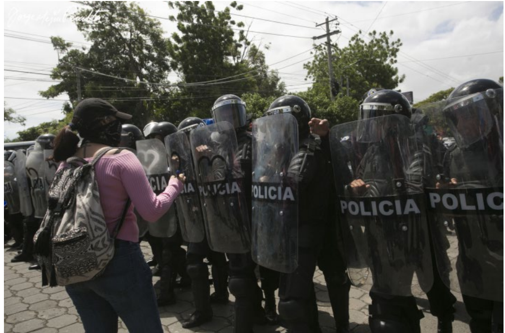
Photo by Jorge Mejia peralta. We Are the Voice march, September 23, 2018. CC BY 2.0.

The defacement of the Sandinista state occurred primarily upon a breach of its revolutionary promise to life, executed by its Sistema. This publicly revealed the most nefarious workings of the Sistema. It is pivotal here that it was not abuses of power or corruption scandals that galvanized street protests. The catalyst was the state's first lethal repression of unarmed dissent. Sandinista practices of remembrance evoke the revolutionary insurrection alongside notions of honor and sacrifice, insisting that a human life will not be lost in vain, much less to an authoritarian state. A life cut short will always claim justice.