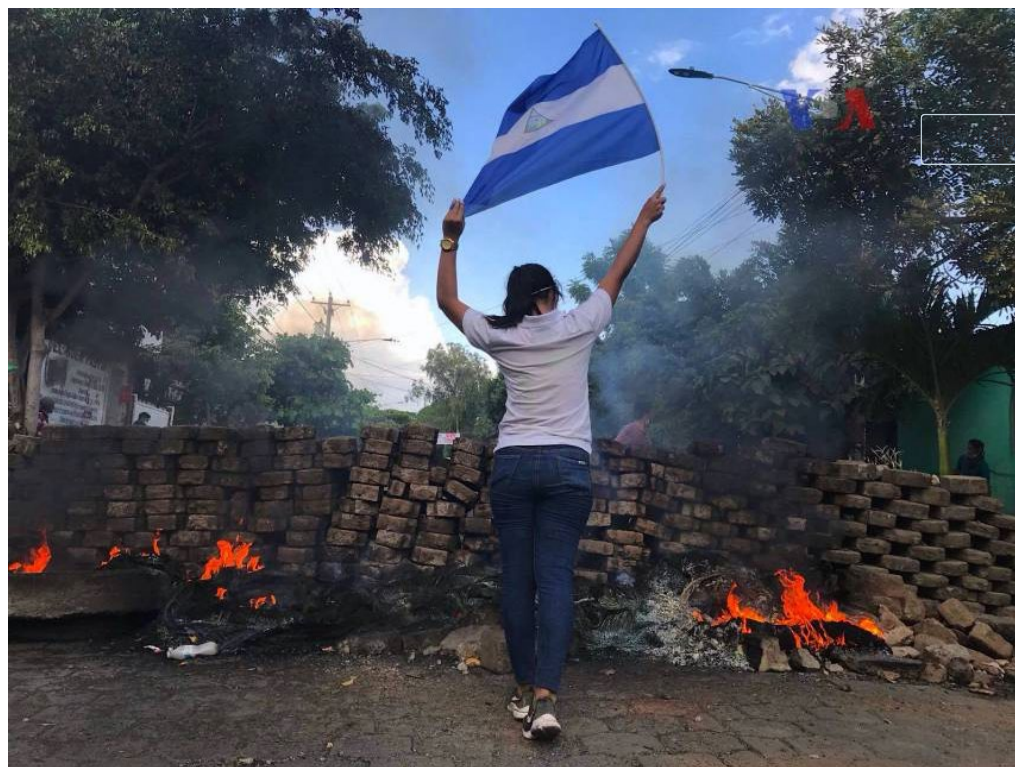
Photo by Voice of America. A woman stands near a burning barricade holding the national flag of Nicaragua. April 20, 2018. Public domain.