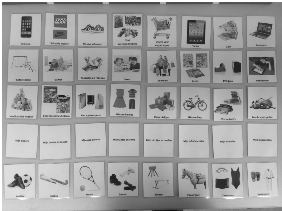
Fig. 3 Photograph of the 40 item cards

Advertising Exposure Children's exposure to advertising was measured through their viewing frequency of several popular network channels. According to Opree et al. (2014), exposure to network channels is a good proxy for advertising exposure – performing just as well as the more content-specific measures of advertising exposure, including measures in which children's exposure to networks and/or programs is weighted for advertising density. Data of the Dutch research company Qrius was used to select the network channels (Sikkema 2012). Based on the viewing preferences of six- to nine-year-olds, we selected the two most popular children's channels, the two most popular publicly funded channels, and the two most popular commercial channels. These six channels (i.e., the children's channels Disney XD and Nickelodeon , the public channels NPO1 and NPO3 , and the commercial channels RTL4 and SBS6 ) were included in the items. The children were asked how often they watched these channels, choosing between (1) “never,” (2) “sometimes,” (3) “often,” and (4) “very often.” Children's final score for advertising exposure was the mean of the six items ( M = 2.03 , SD = .41 ).