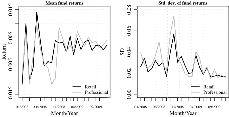
Figure 4.3: Mean fund excess returns over benchmark (left) and standard deviation of excess returns (right) of mutual funds for retail and professional investors, from January 2008 to December 2009.

assets originated by the financial sector, funds invest mainly in certificates of deposit and bank debt securities.