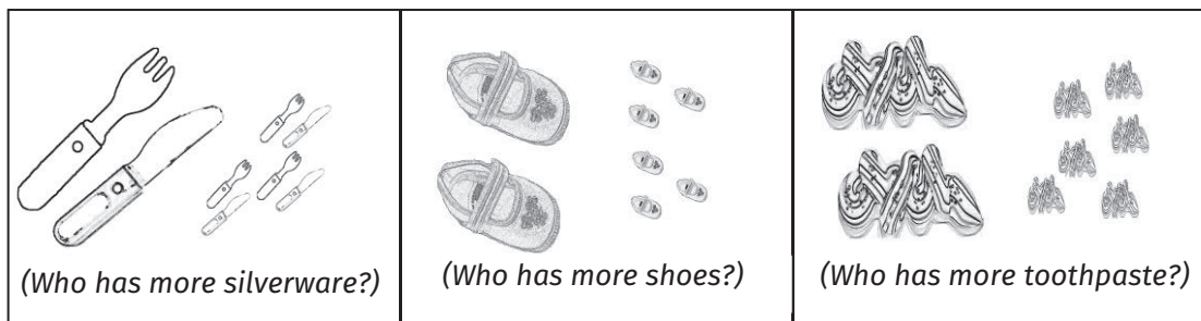
Figure 2: Illustration of experimental items in Experiment 2 (Barner & Snedeker 2005: Figure 3).