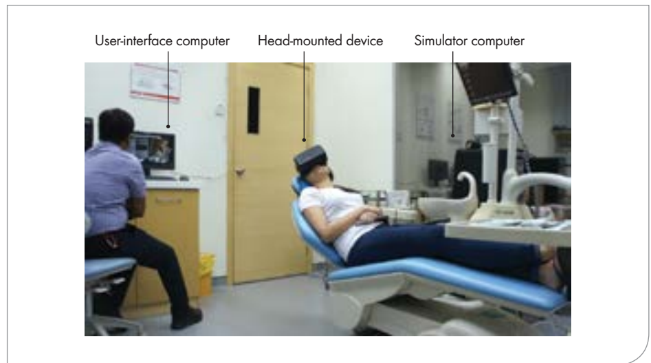
FIGURE 1. Showing the VRET device.

During the last decade, several technology-based interventions such as Computer-Assisted Relaxation and Learning (CARL), 25 computerized-CBT (C-CBT) 26 and virtual reality exposure therapy (VRET) 27,28 have been developed to help alleviate patients' dental anxiety. CARL is a computer-based exposure therapy that trains the patient in relaxation, distraction and enhancement of their self-efficacy. This program is designed to first run in an in vitro mode followed by an in vivo mode. The in vitro mode involves computer-controlled, hierarchical exposure to videotaped scenes of the injection procedure, while the in vivo mode involves exposing patients to a hierarchy of a real-life injection procedure. C-CBT involves computerized psychoeducation,