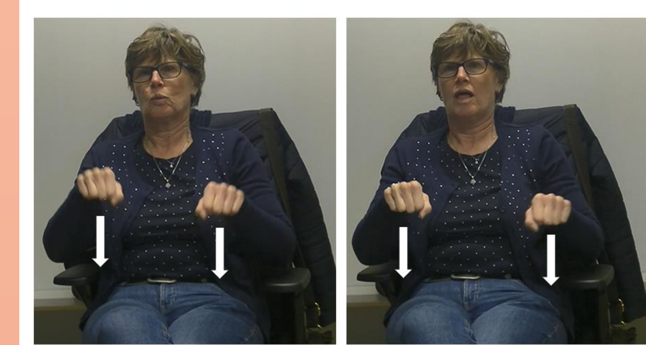
Figure 2b. CHAIRS in NGT