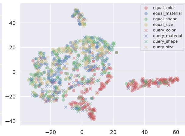
Figure 2: Analysis of the neuron activations on the penultimate hidden layer of the model trained independently on Y/N-q.