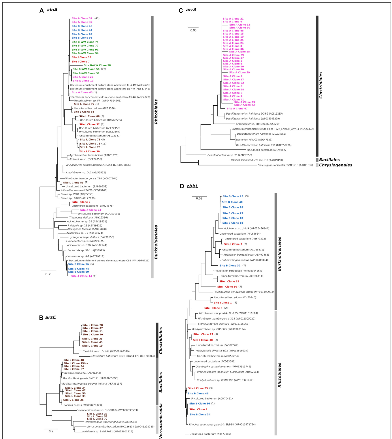
FIGURE 3 | Phylogenetic analysis (neighbor-joining tree) of deduced amino acid sequences of aioA (A), arsC (B), arrA (C) and type I RuBisCO cbbL (D) genes cloned from arsenic-contaminated aquifers and sequences from the NCBI database. As outgroup for the calculations, the AioA sequence of Hoeflea phototrophica DFL-43, the ArsC sequence of Achromobacter xylosoxidans A8, the ArrA sequence of Shewanella sp. ANA-3 and the CbbL sequence of Ancylobacter dichloromethanicus As3-1b were used. The scale bar represents a difference of 0.2 nucleotides per position for AioA and ArsC, of 0.05 for ArrA, and of 0.02 nucleotides per position for CbbL.