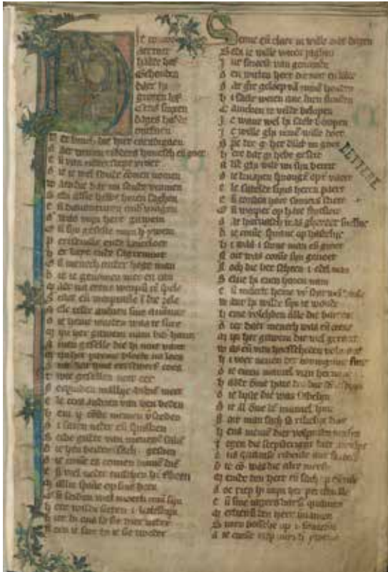
Figure 2. – Début de Ferguut , Leyde, University Library, MS Ltk. 191, f° 1 r°.