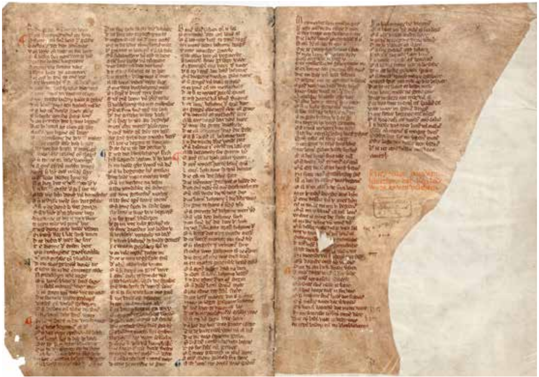
Figure 4. – Fin de la compilation de Lancelot Compilation : ex libris de Velthem, La Haye, Royal Library, 129 A 10, f° 237 v°-238 r°.