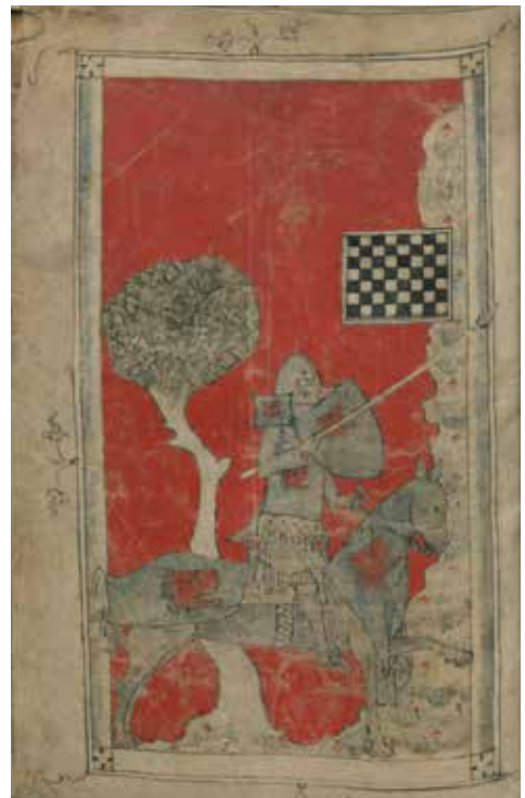
Figure 3. – Walewein héros à la poursuite de l'échiquier Vlont , Leyde, University Library, MS Ltk 195, f° 120 v°.