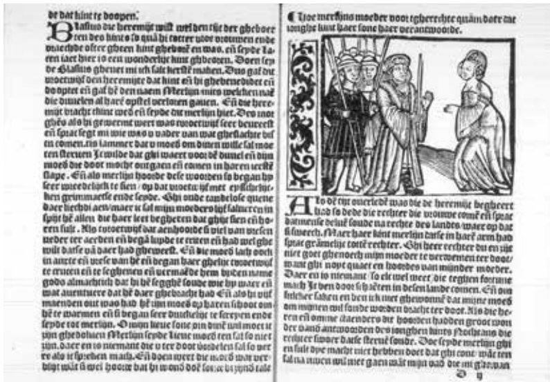
Figure 5. – Historie van Merlijn, bois gravé, la mère de Merlin à la cour, Bruxelles, RL, Oude Druk, v.H. 27526, f° D1 v°-D2 r°.