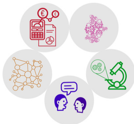
Figure 2 Different ways of operationalising COVID-19.

The disciplines of virology and clinical medicine collaborate closely. For instance, the diagnostic tests that allow clinicians to ascertain if a patient is indeed infected with SARS-CoV-2 were crafted by virologists, while virologists learn from clinicians how the virus impacts its human hosts. 5 At the same time, the object of these two disciplines is different. Virologists study all kinds of viruses, and their objects of inquiry include viruses' genes, history, hosts, levels of virulence and transmission routes. This means that, for virologists, 'COVID-19 is a contagious disease due to an infection by a specific type of coronavirus: SARS-CoV-2'. 6 In the world of virologists, the surge of COVID-19, while new in its particulars, was an accident waiting to happen. They had been warning