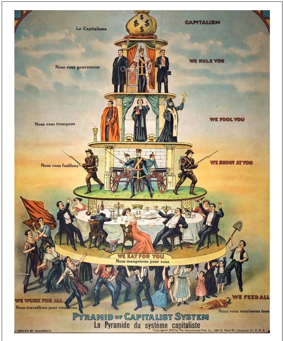
Figure 2. Pyramid of capitalist system.

humans have been put in this circular lifestyle, just a repeating cycle of work, eat, sleep and work, eat, sleep . . . so that we spend so much time surviving and not lift our head up to see what's going on. (3:35:30)