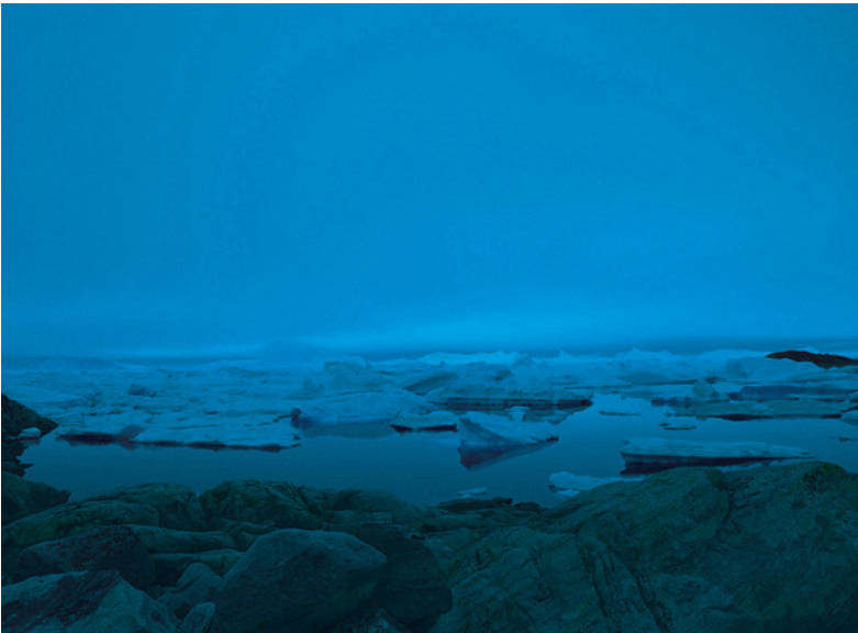
Ilulissat Icefjord, June 2019.